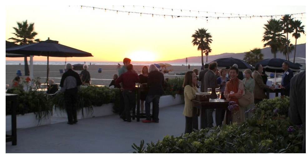
Sunset at the Beach Club

A special thank you to everyone who renewed their membership, made direct cash donations, attended the annual dinner, and/or purchased items from the auction and boutique. Your generous participation allows the EAC to grant significant funds to local museums and institutions for exhibitions, publications, and research projects!