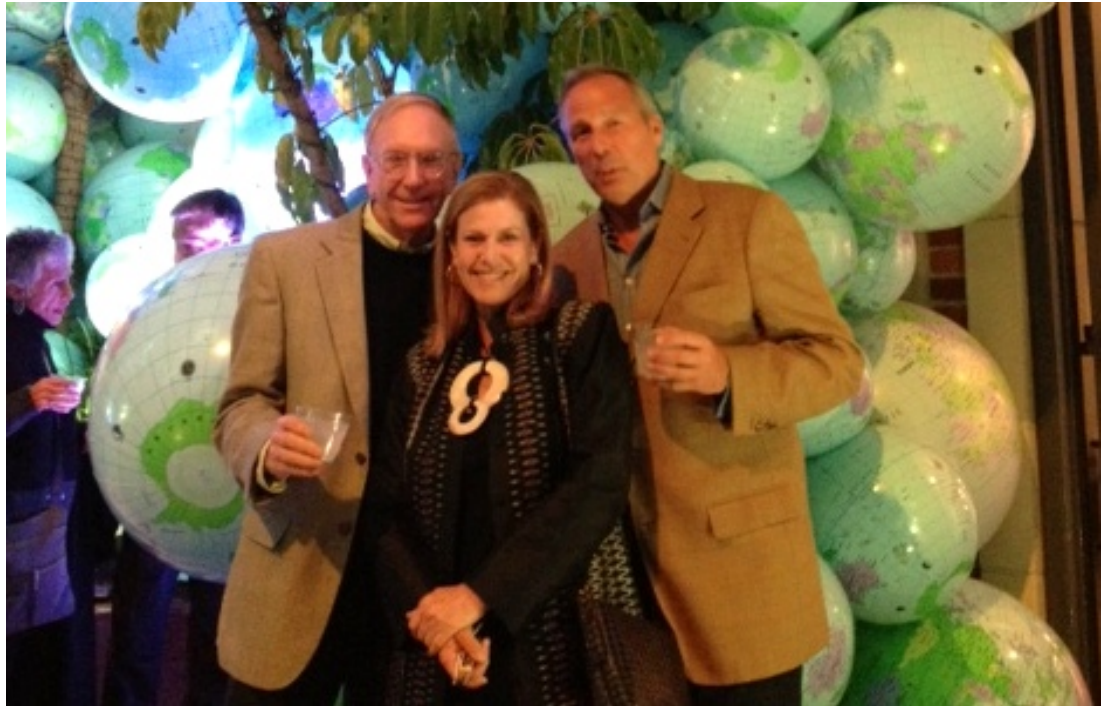
EAC members at the Fowler