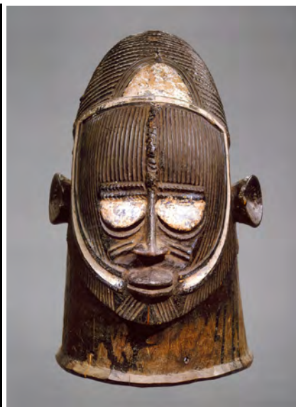
Royal Helmet Mask • Igala People

The second grant award went to LACMA for the 2011 exhibition Children of the Plumed Serpent: Heroes and Ancestors of Ancient Mexico . This exhibition will focus on the period before the rise of the Aztec Empire that saw, by the 16 th century, the successful integration of indigenous and European social and cultural practices, which is reflected in the dynamic artistic production. EAC will provide the authors' fees for a scholarly catalogue that traces