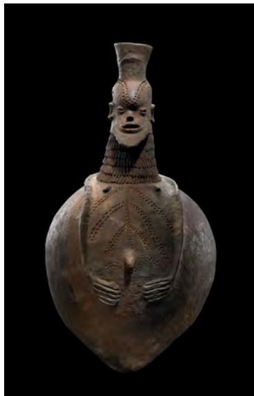
Ancestor Vessel • Jungur group

The first grant award went to the Fowler Museum for Central Nigeria Unmasked: Art of the Benue River Valley , the first major international exhibition to present a comprehensive view of the remarkable arts produced by the many and diverse peoples living in the Benue River Valley in Nigeria. This exhibition features more than 150 extraordinary objects drawn from museum and private collections in the United States and Europe, and provides an unparalleled opportunity to discover the rarely-seen artistic genres of Central Nigeria. Twenty-five years in the making, this show represents the curatorial prowess of Dr. Marla Berns.