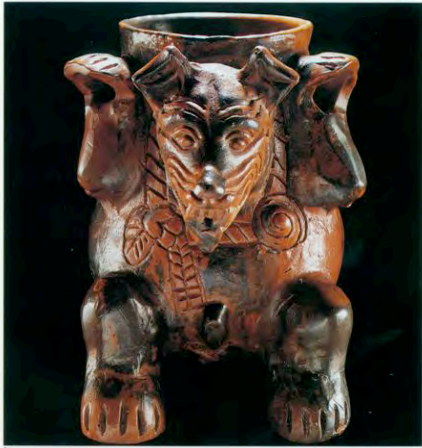
Dog effigy vessel

the trajectory of the exhibition narrative with essays, sidebars, and object entries by experts in the various fields.