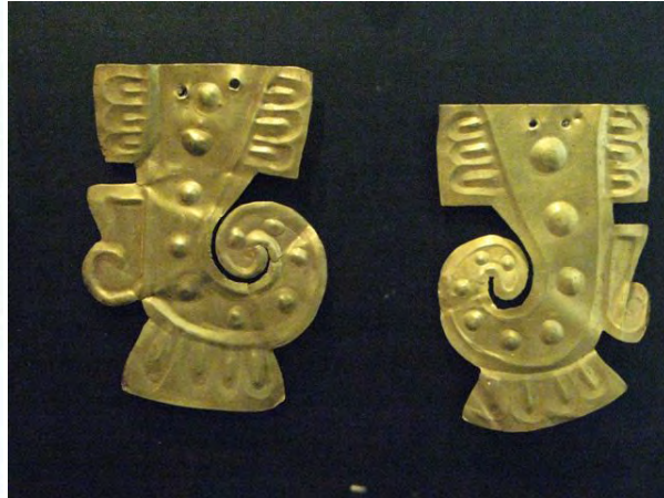
Quetzalcoatli's gold wind jewels