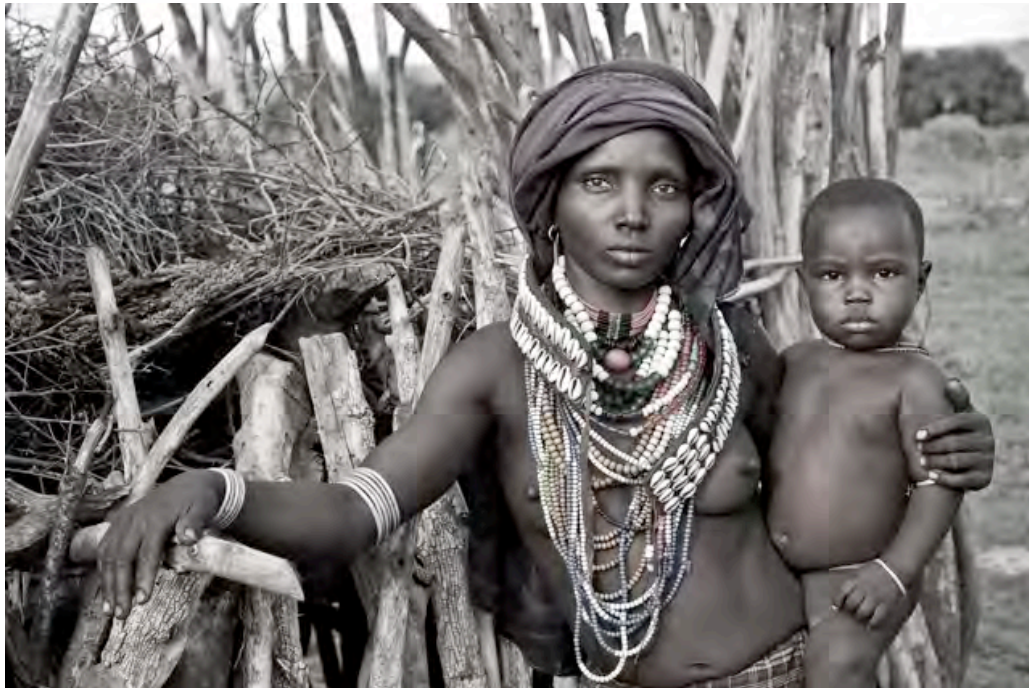
Mother and child, Ethiopia.