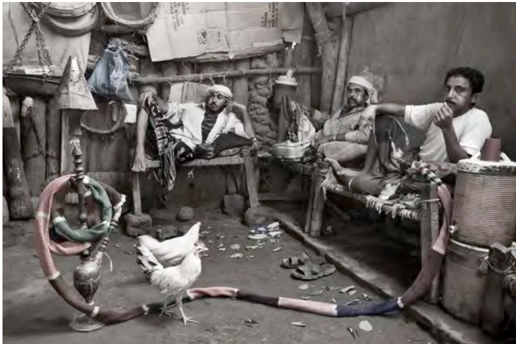
Men smoking Hookah, Yemen.